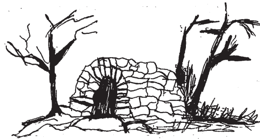
Old Government Spring on Dick Saunders place. This spring is situated at the foot of a small hill covered with elm and walnut trees.