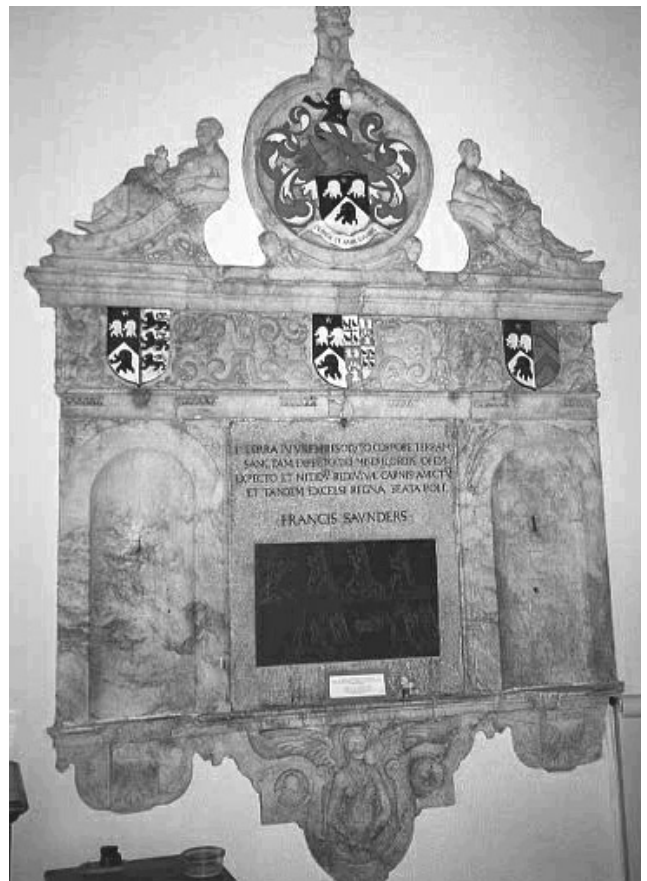
This is the Francis Saunders monument at the Church of St. Mary in Welford, England. See page three for translation of Latin on monument.